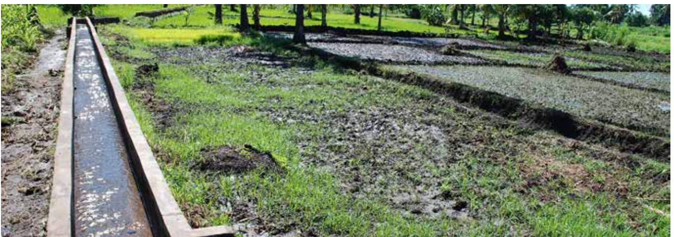
The farmers of Kiroka village in Morogoro District of Tanzania are benefitting from an irrigation scheme implemented through the national agriculture sector development programme, supported by Irish Aid. The irrigation scheme covers 147 hectares and makes it possible to grow a greater range of crops and harvest twice each year.

This will be achieved through working in partnership with government in strengthening Tanzania's institutional framework and its nutrition responses at a national and district level. In addition, Ireland will promote greater engagement of civil society and research institutions in nutrition interventions.