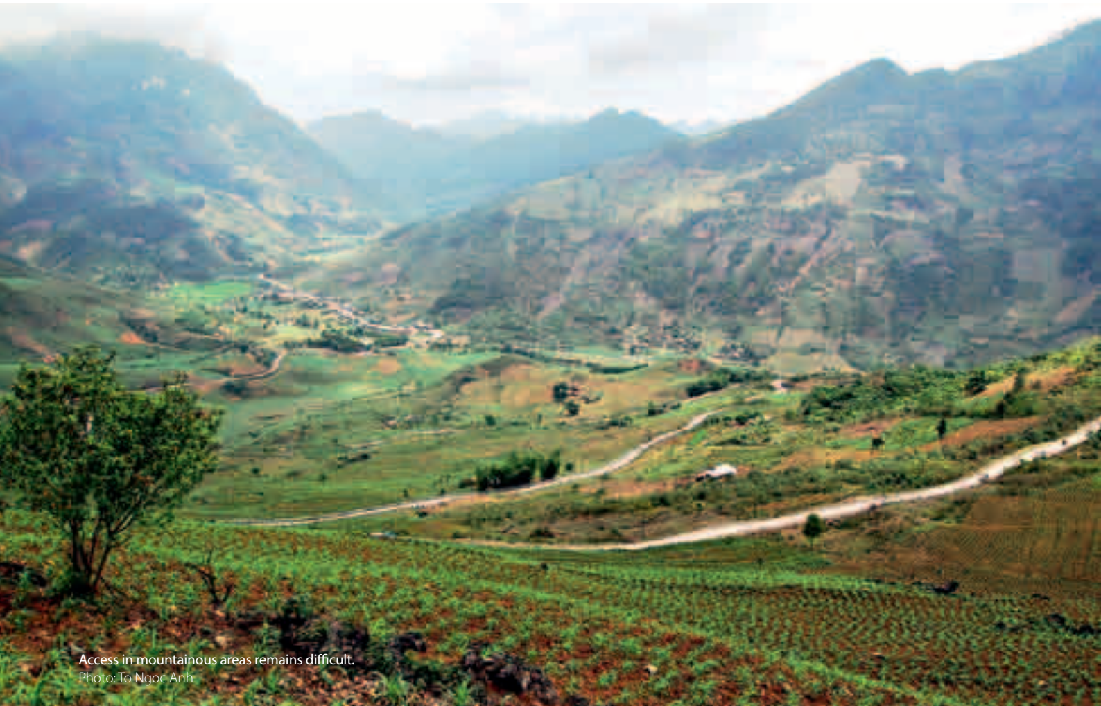
Access in mountainous areas remains difficult.

Civil society's role and influence continues to grow, opening up opportunities and space for more policy and social debate.