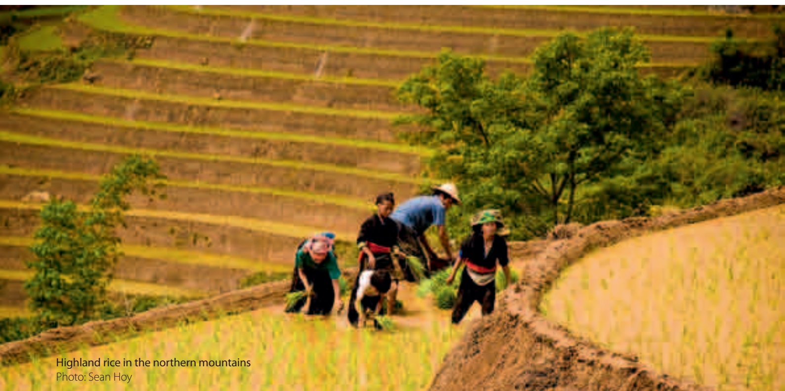
Highland rice in the northern mountains