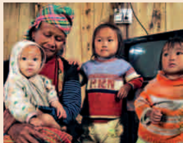
HMong family in Dien Bien province

Thematic areas of interest are agreed through a joint Ireland-Vietnam steering group which meets twice a year. A review in 2010 concluded that the IDEAS programme was valued by Vietnam and should continue. The areas to be addressed will evolve over time to take into account Vietnam's changing needs and Ireland's capacity to respond.