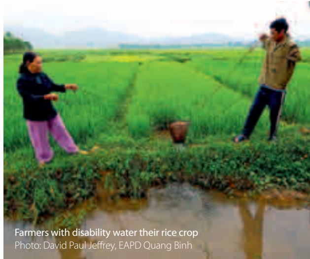
Farmers with disability water their rice crop

Inclusion of community groups, businesses and non government organisations in the design and implementation of programmes is a key issue for Vietnam. Responding to the needs of ethnic minorities and people with disability requires knowing more about who they are and what interventions will work for them. Innovation will include providing grants directly to communes, allowing communes to make purchases and manage contracts locally and setting up partnerships with local businesses and civil society organisations to test new initiatives.