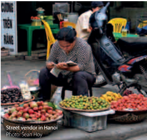
Street vendor in Hanoi

Irish Aid will work with government and partners in Hanoi and in the provinces to include these groups in key policy processes. There is very little data available which captures the experiences, opinions and realities of poor Vietnamese families and individuals of all ages. Irish Aid will fund research to record their views. The evidence gathered will improve the design of existing programmes and will be used to develop new strategies. It will help ensure that government resources reach people who need them. Innovation will be required in order to introduce new thinking and approaches into government programmes. Examples might include household grants or rotating credit schemes.