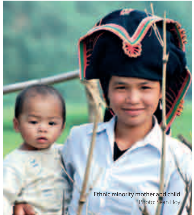
Ethnic minority mother and child

Ireland directly funds and supports civil society organisations in Vietnam. Irish Aid's civil society partners work with the most vulnerable groups in society. Projects aim to increase public information and accountability and to test new approaches to poverty reduction. Irish Aid supports local groups with grants and also links them with international partners overseas (including in Ireland). Irish Aid is proud of the results achieved through this scheme, including greater acceptance of people living with disability and people living with HIV & AIDS.