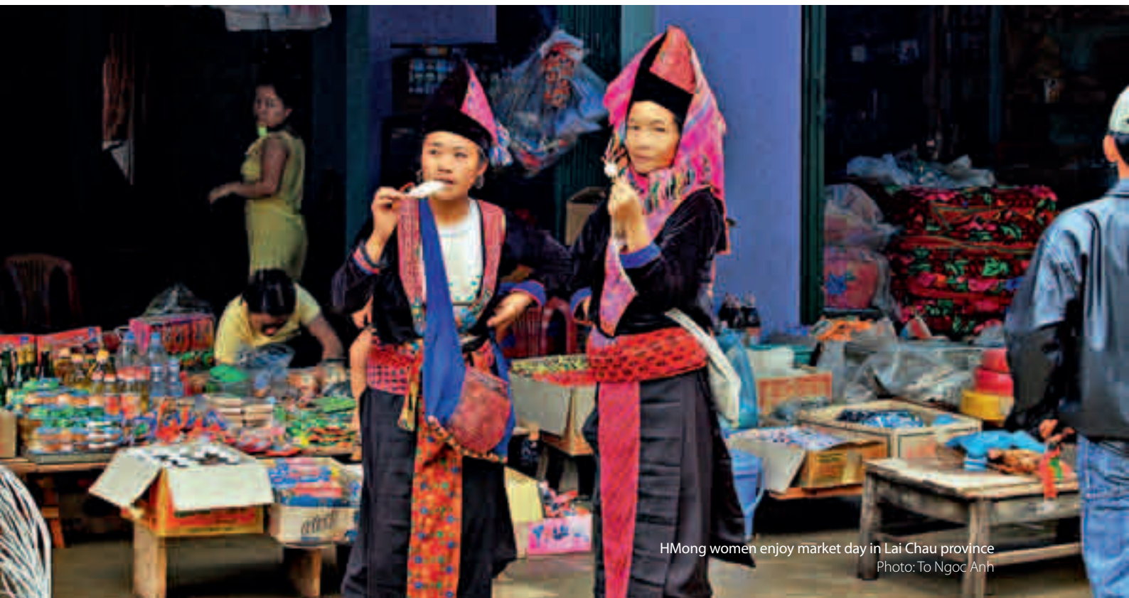
Hmong women enjoy market day in Lai Chau province

Ireland provided grant funding to the Mekong Private Sector Development Facility (MPDF) to support private sector development in Vietnam, Cambodia and Laos. The programme played an important role in reducing red tape for small businesses and increasing access to credit. MPDF