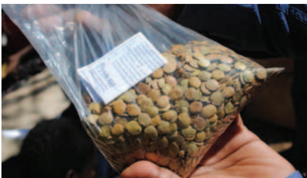
Irish Aid supported agroforestry seeds.

Irish Aid also supports the International Crops Research Institute for the Semi-Arid Tropics (ICRISAT) which focuses on partnerships between farmers, seed traders and government to improve the availability of, and access to, improved varieties of legume seeds. Cooperation with the World Agro-Forestry Centre (ICRAF) is aimed at increasing food security, income and livelihood opportunities for rural communities through the use of technologies that enhance soil fertility and promote sustainable land management practices. Irish Aid supports the National Smallholder Farmers Association of Malawi (NASFAM) in rolling out a national programme to promote the principles and practice of conservation farming among smallholder farmers.