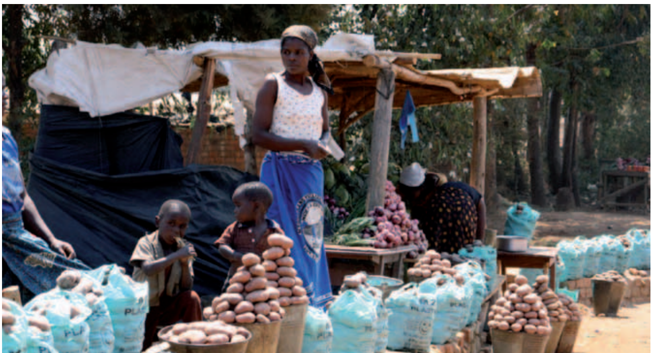
Small holder farmer selling potatoes at a roadside market.