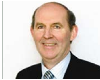
Minister of State for Overseas Development, Michael Kitt T.D.

It gives me great pleasure to introduce the Irish Aid policy for local development. Irish Aid is committed to reducing poverty at local levels and ensuring that our development interventions have an impact on ordinary local men and women and their communities.