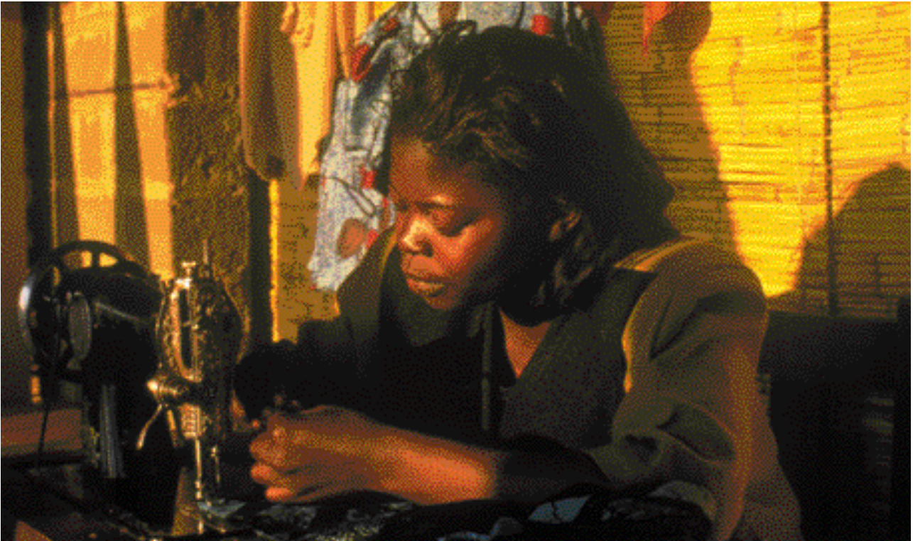
Income generating activity, dress making, Kamanga, Zambia

in Zambia. At the national level, we have proactively engaged with government and civil society to advocate on various HIV/AIDS related issues. Our work with the National AIDS Council, for example, will help strengthen the Council to enable it to effectively carry out its duties of coordination and integration of efforts to combat HIV/AIDS. This support extends to the provinces and districts where institutional capacity-building and direct support to communities form the core of the programme. Through our advocacy fund, we support a local NGO which promotes the rights of people living with HIV/AIDS. An example of this partnership is the broadcasting, over thirteen weeks, of radio programmes addressing issues of stigma and discrimination. The programmes gave an opportunity for discussion which allowed the listeners to phone in and talk about their personal experiences or ask questions. This programme has contributed to breaking the silence on HIV/AIDS and follow-up series are underway.