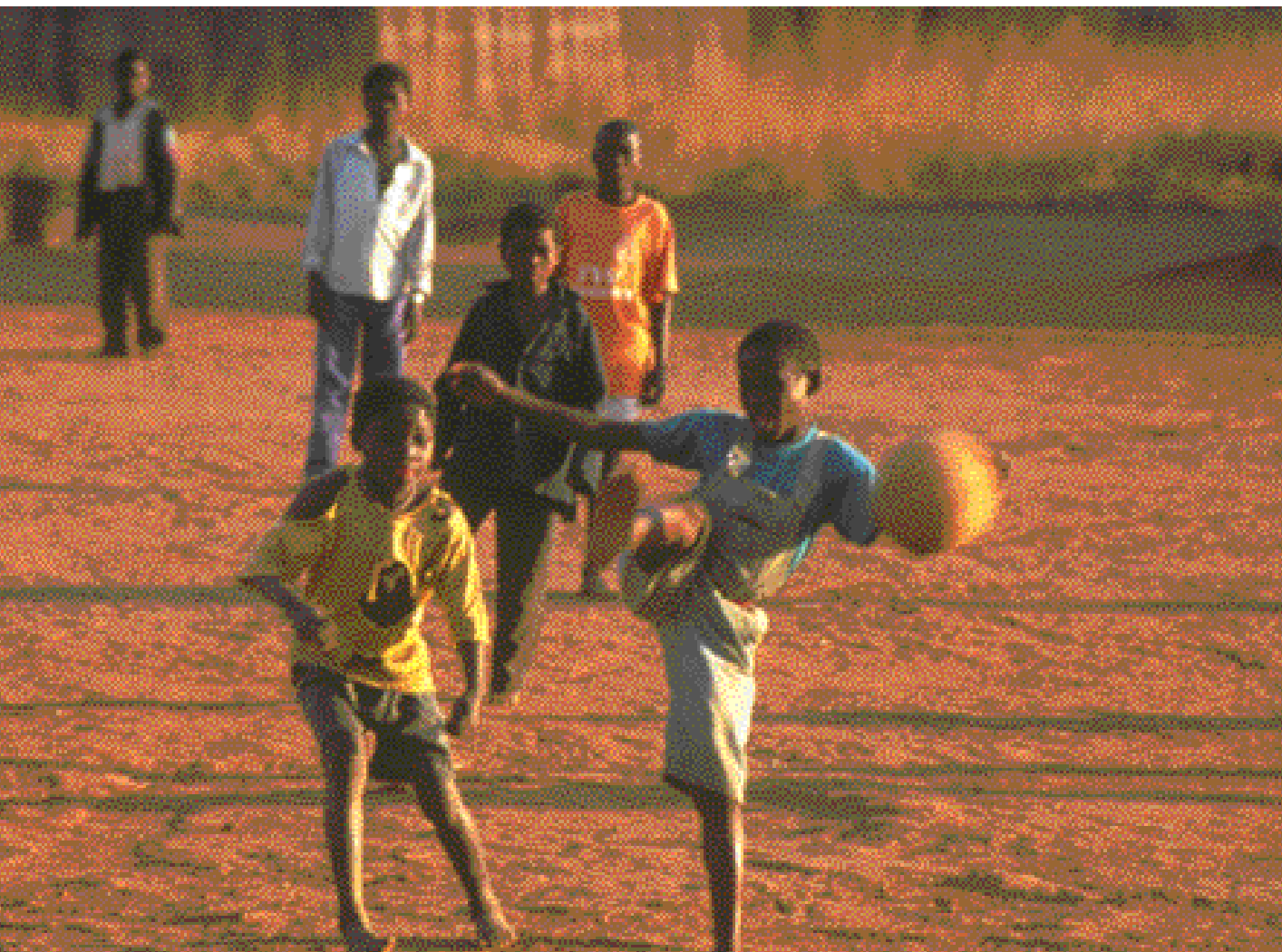
A game of football at the primary school in Nanshenje, Mozambique