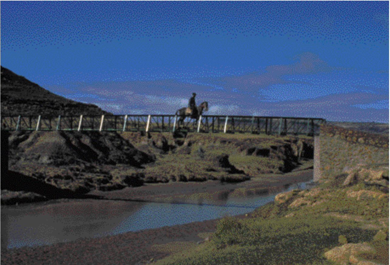
Rural Foot Bridge over Seqonoka river, Lesotho highlands