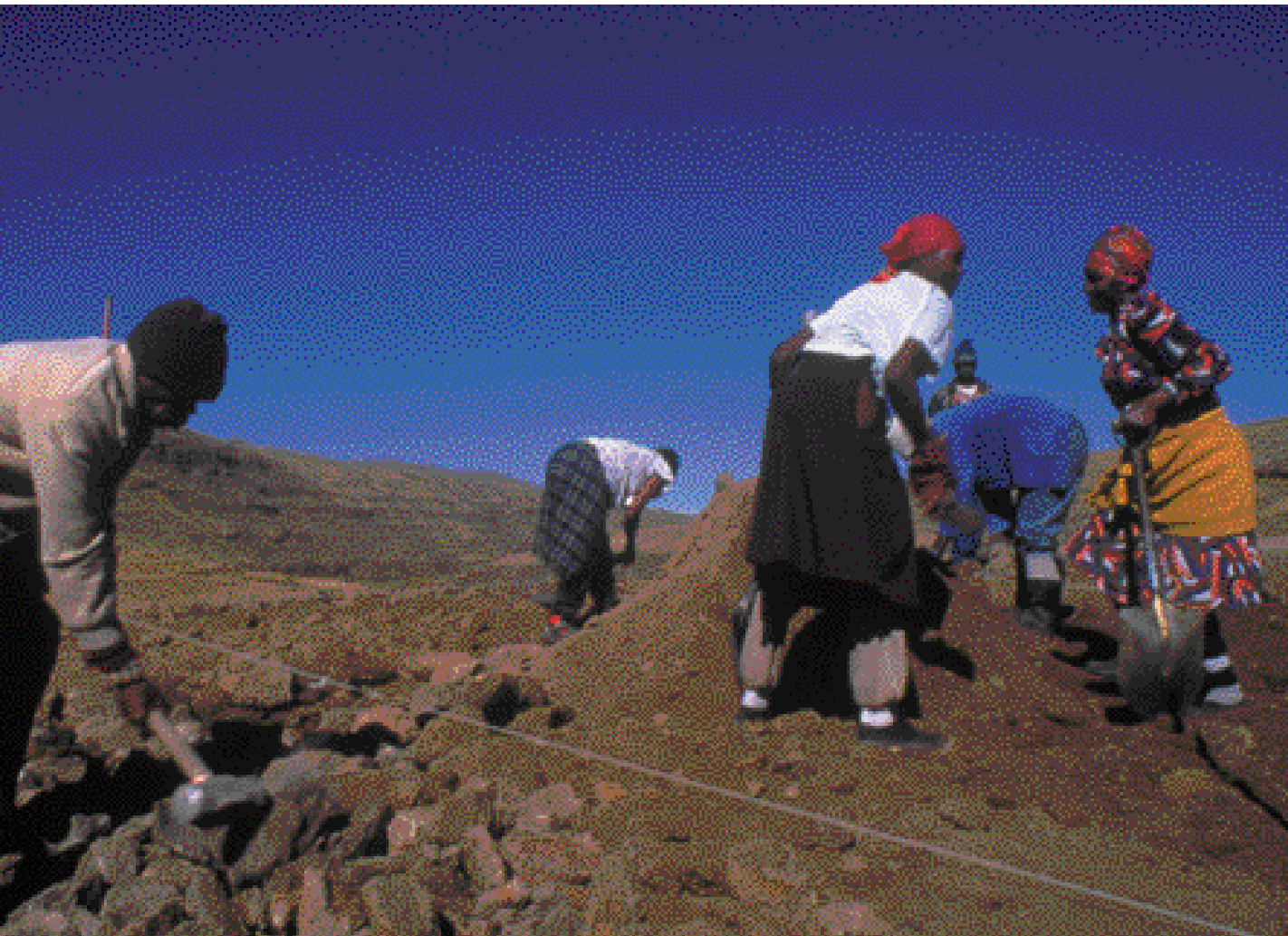
Road Construction, Mekhtlong district, Lesotho