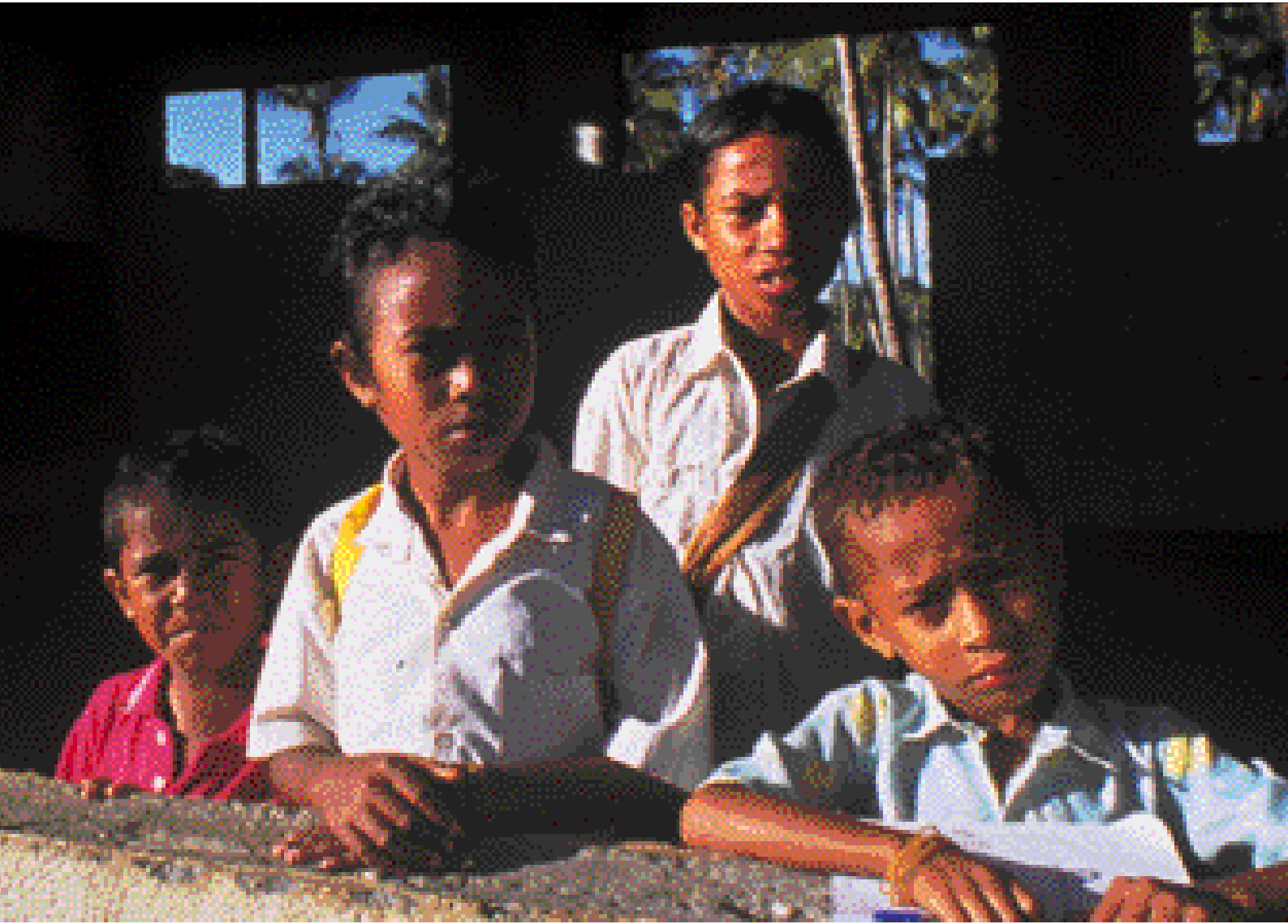
Boys in the shell of Hatudu primary school, East Timor