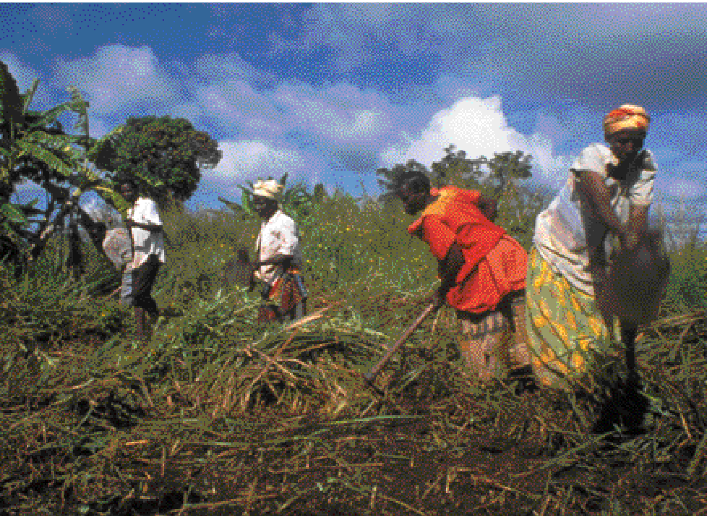
Bush clearing to make way for road construction, Kiboga District, Uganda