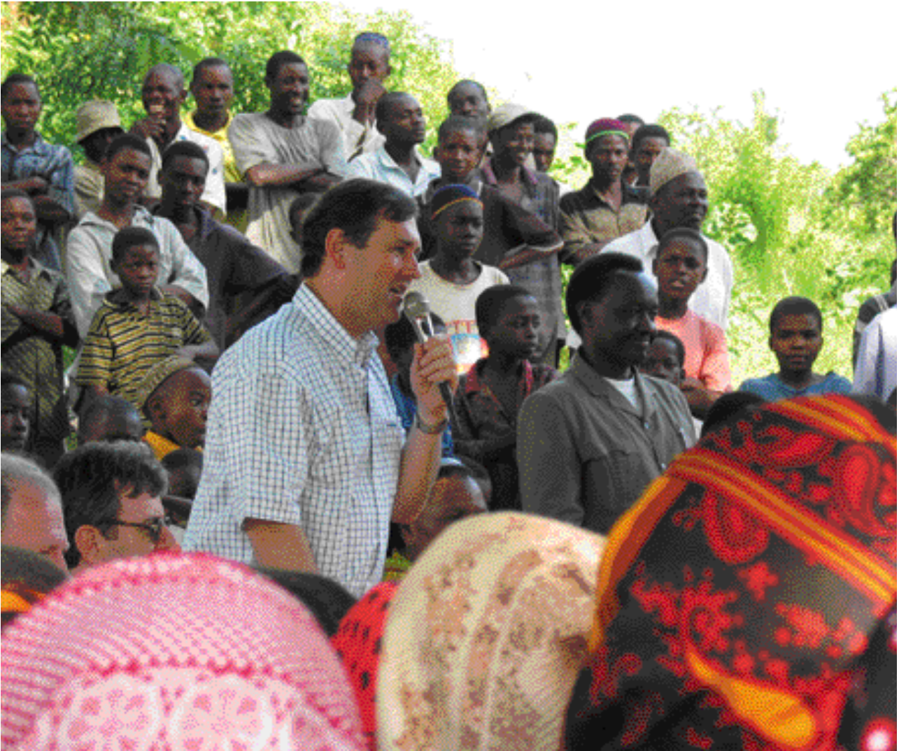
Minister of State, Tom Kitt T.D. addressing the Gombero school in Muhesa district, Tanzania

Throughout the education reform process, there has been a broad range of public consultation, in particular with civil society organisations. DCI supports Haki Elimu, an innovative NGO whose particular focus is upon issues relating to governance at primary school level and, more specifically, strengthening the participation of women, men and children in the running of their education system. The project is particularly relevant in the context of the on-going education sector and local government reforms within which decision making authority will be devolved to school committees and communities. Traditionally, decisions on the delivery of education services have been a function of the central authorities.