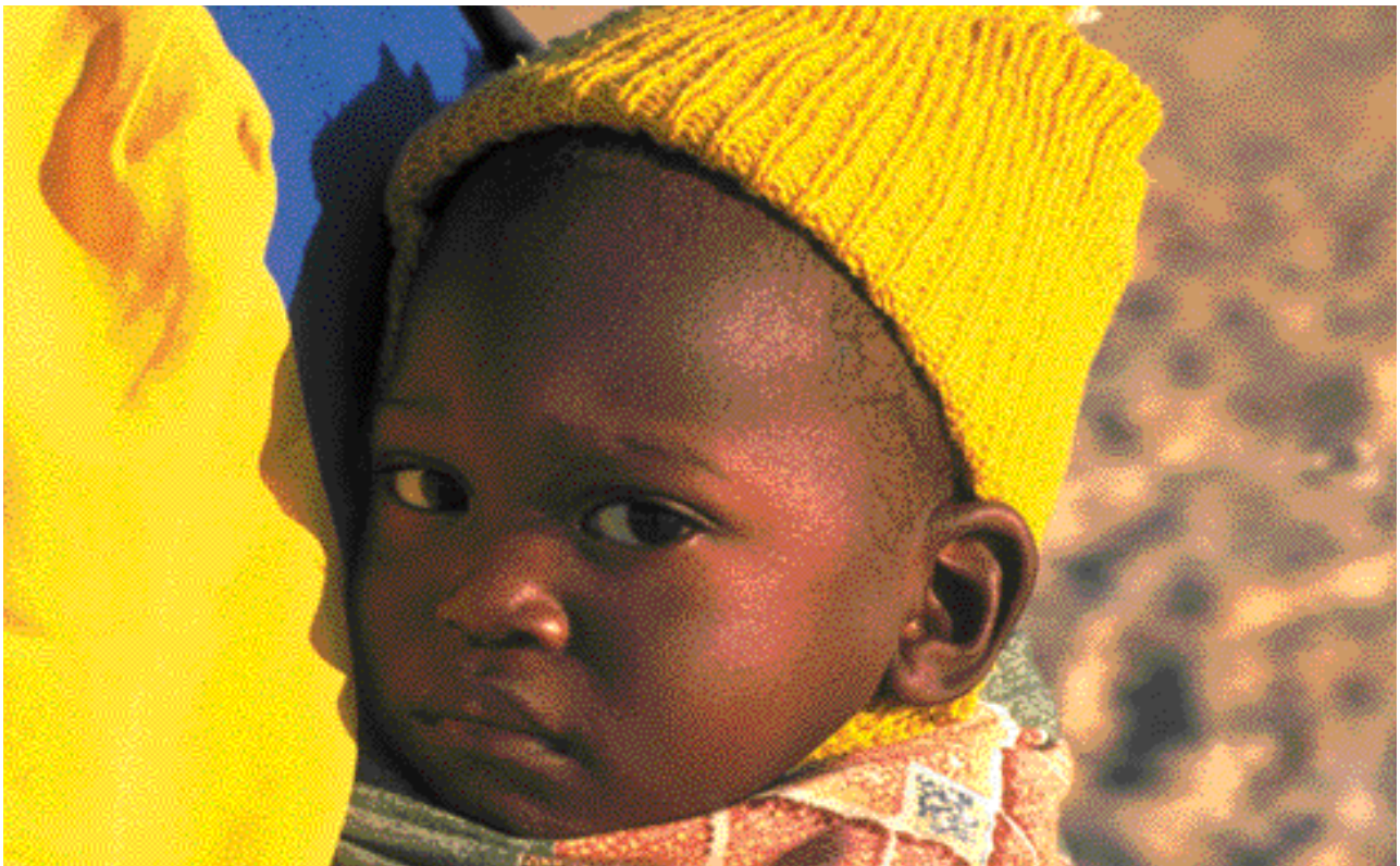
Future Fisherman being carried by his mother, Maputo, Mozambique

(iii) Pool for SWAp Development (PESS) : Ireland, the UK and Norway contributed to this pool in 2002, (with Development Cooperation Ireland as the biggest donor at €350,000). The pool funded the sector strategic plan (PESS) and now funds the various processes relating to its implementation. Political commitment and interdepartmental sector coordination greatly improved in 2002.