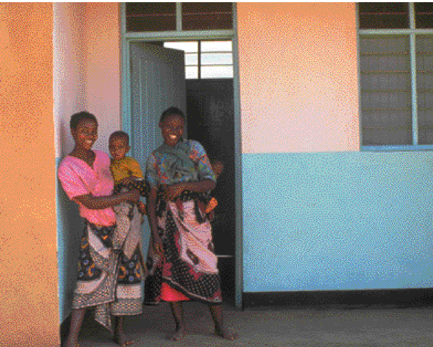
Housing for teachers at Italagawe primary school, Kilosa district, Tanzania