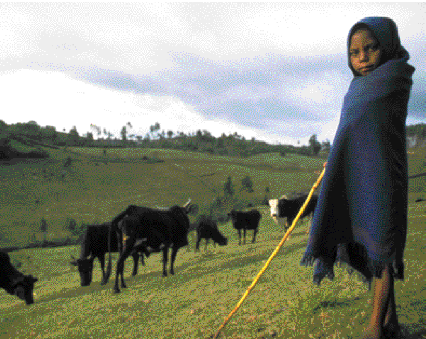
Cattle Herder in the Sidama region, Ethiopia