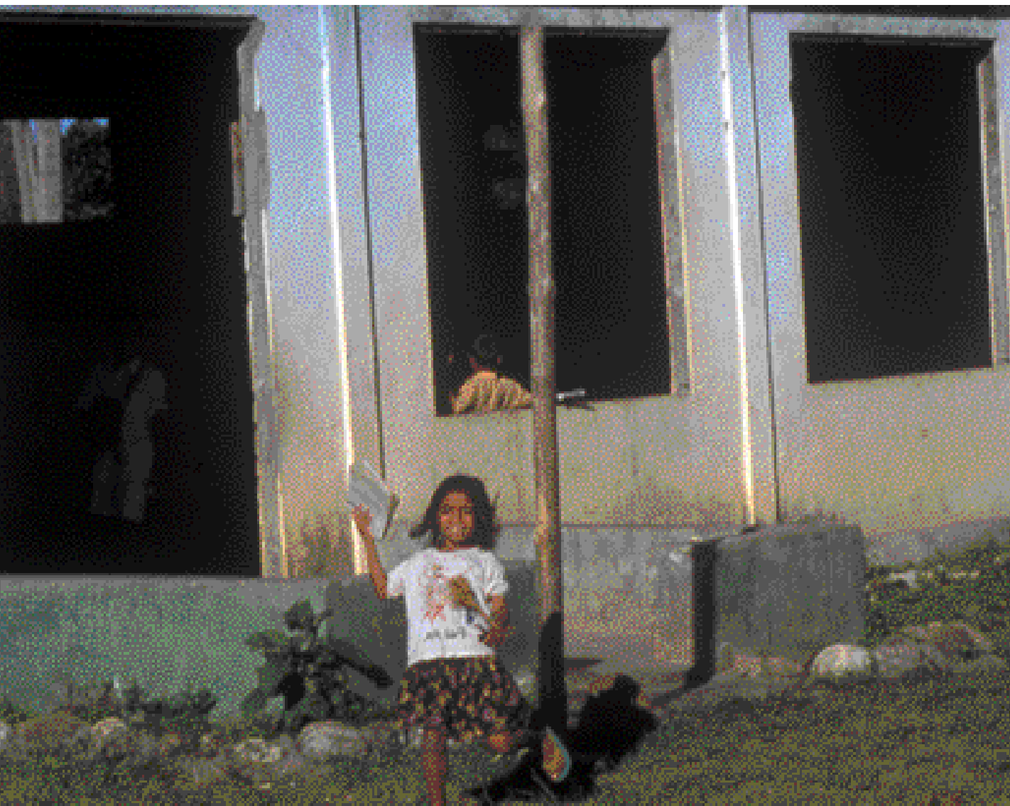
Hatudu primary school, East Timor