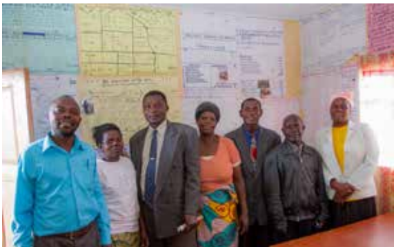
The Executive Committee of the New Kamwanya Resident Development Committee in their newly completed offices.