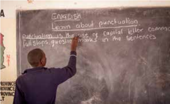
The Study Centre at Sunsuntila Orphan Day Care Centre, Mbala.

"Ireland has done so much, it really has contributed so much to a place like Mbala."