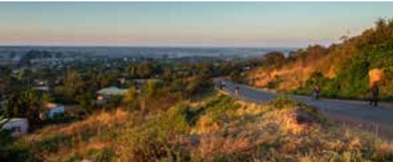
The District of Kasama and domain of the Mambwa Royal Highness.

"Since the 1990s, when the President of Ireland came to open that School in Kamena, we have known of Irish Aid. We are very grateful."