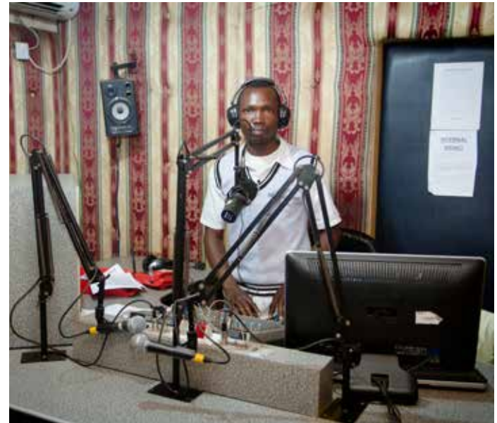
A Radio Mano DJ at work presenting an evening broadcast.

“Civilisation brought to your doorstep,” he concludes.