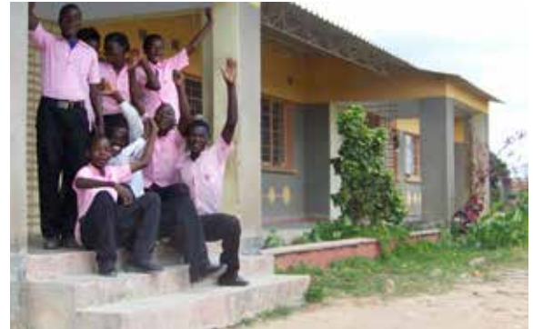
Students from Chisanga School, Kasama.

It seems that the new facilities and better resourced staff are having an effect on the students themselves. “In 2011,” he continues “we graduated our first grade 7’s who had studied in the new school – the first set of students to write their exams from this building. When the results came out, we did very well, and our pass rate was 94.8%”