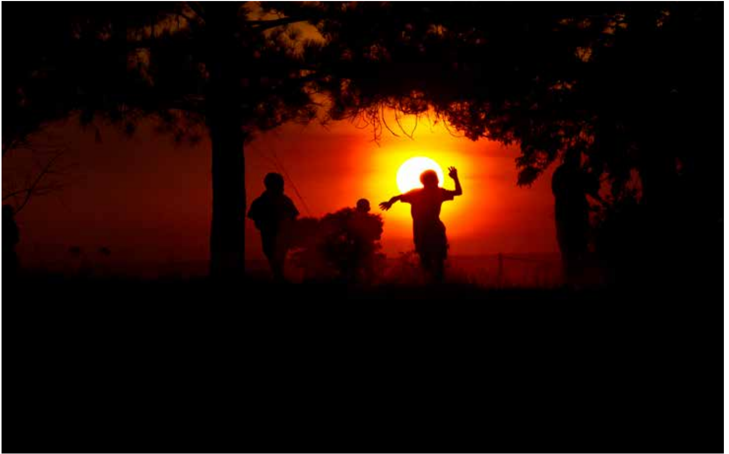
All photographs used in Northern Voices were shot on location in Zambia's Northern Provinces by Chosa Mweemba, June 2012.