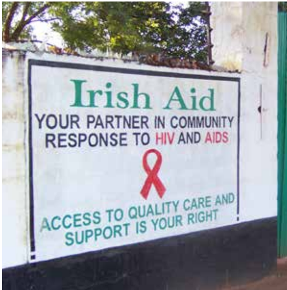
Irish Aid Offices, Kasama, Northern Province.