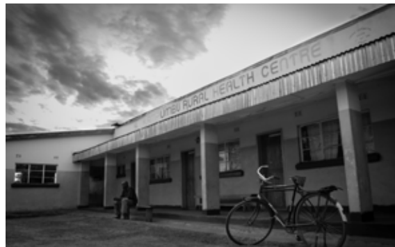
A patient waits to be seen by the nurse at Kampumbu Rural Health Centre, constructed by Irish Aid in 2001.