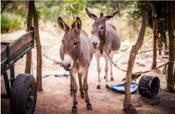
Village orphan support groups use farming inputs, like these donkeys, to generate income that they reinvest in the community.